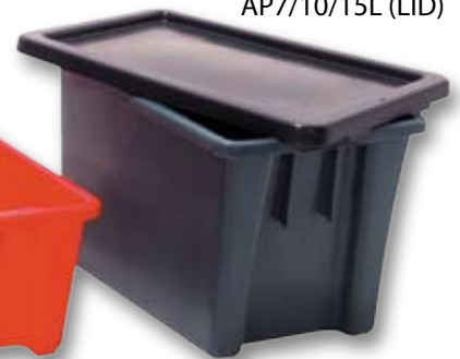
AP15 AP15/RECBK AP7/10/15L (LID)