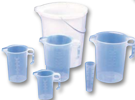
FD0100C to FD20000B