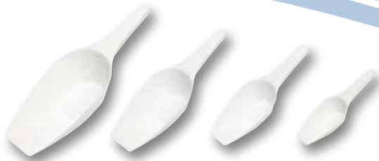
FCPW391 to FCPW399